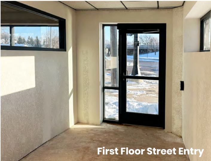
First Floor Street Entry