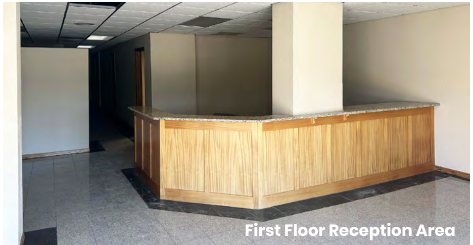
First Floor Reception Area