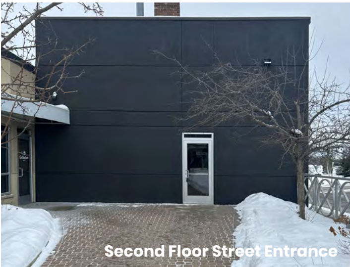
Second Floor Street Entrance