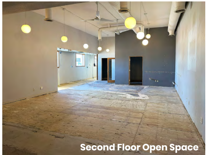
Second Floor Open Space