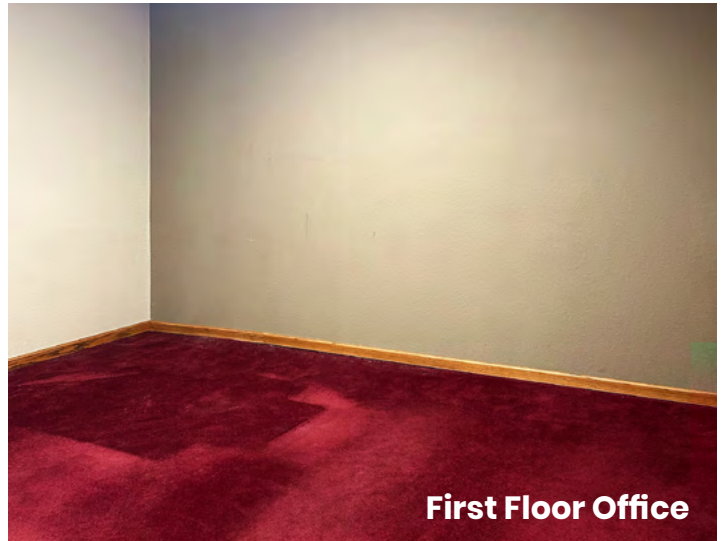
First Floor Office