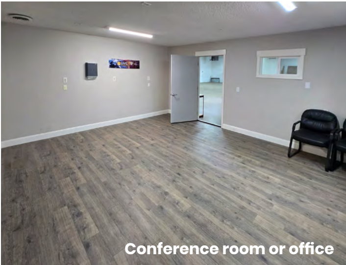
Conference room or office