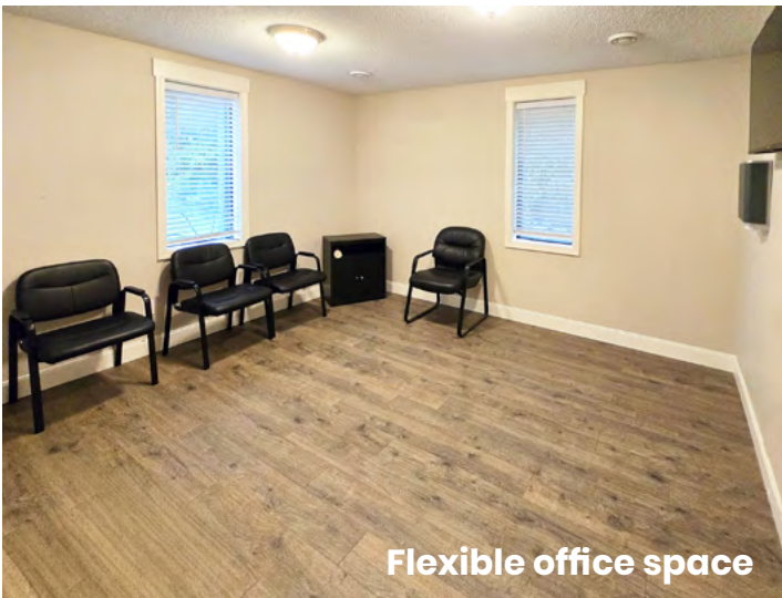
Flexible office space