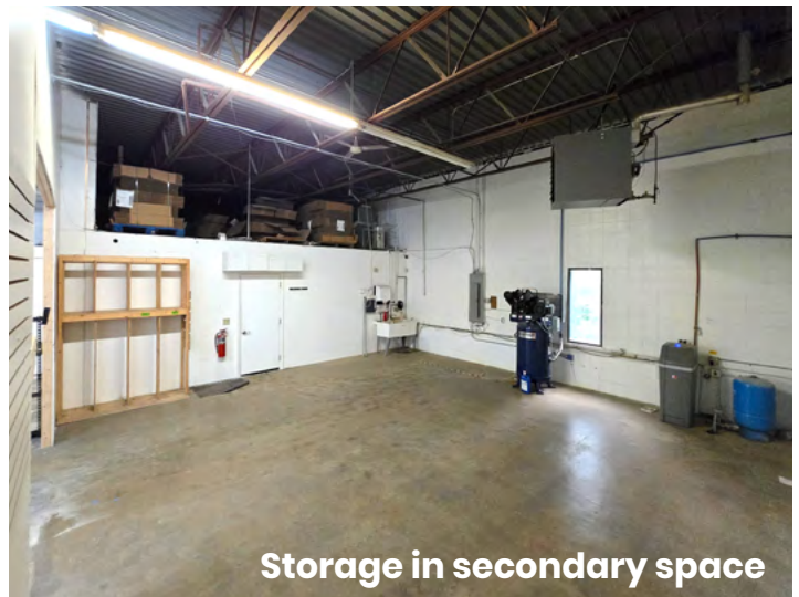
Storage in secondary space