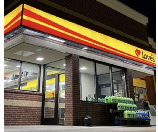
2 miles from Love's Travel Stop